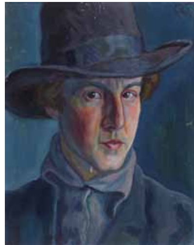
Table I/5: Roman Petrović, Self-portrait , oil on canvas, 1918-19, courtesy of the Art Gallery of Bosnia and Herzegovina, Sarajevo