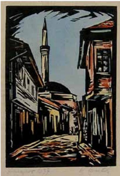
Tables IV/2: Daniel Kabiljo, A Street in Sarajevo , colored linocut, 1920s-1930s