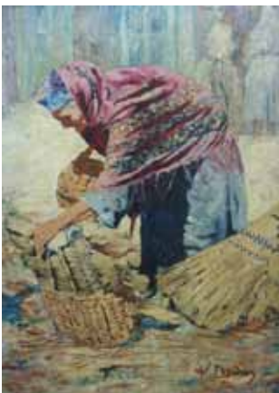
Table III/4: Daniel Kabiljo, The Old Sephardic Women on The Market , oil on canvas, 1935, courtesy of the City Museum of Sarajevo