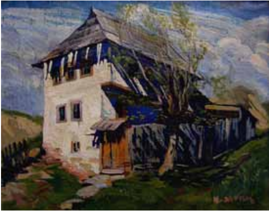
Tables I/1: An Old House , oil on canvas, 1930s, courtesy of the Art gallery of Bosnia and Herzegovina, Sarajevo