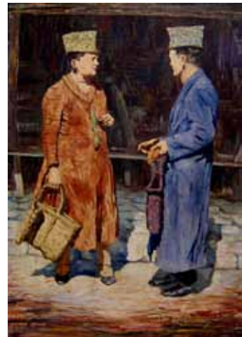
Table III/5: Daniel Kabiljo, The Conversation , oil on canvas, 1930s, courtesy of the City Museum of Sarajevo