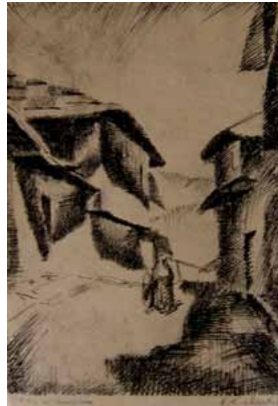
Tables IV/3: Daniel Kabiljo, A Street in Sarajevo , India ink on paper, 1920s-1930s, courtesy of the Art gallery of Bosnia and Herzegovina, Sarajevo