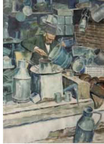
Tables III/2: Petar Šain, The Tinsmith , oil on canvas, 1920s, private collection, Sarajevo