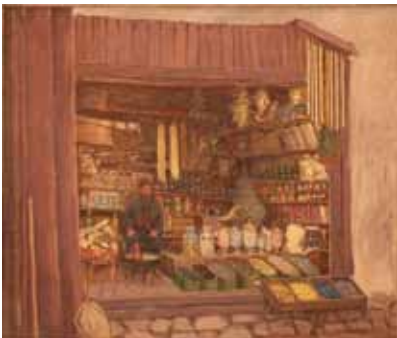
Table II/6: The photograph of an old Jewish pharmacy, photograph published in Dr. Moric Levi, Die Sephardim in Bosnien , Sarajevo, 1911