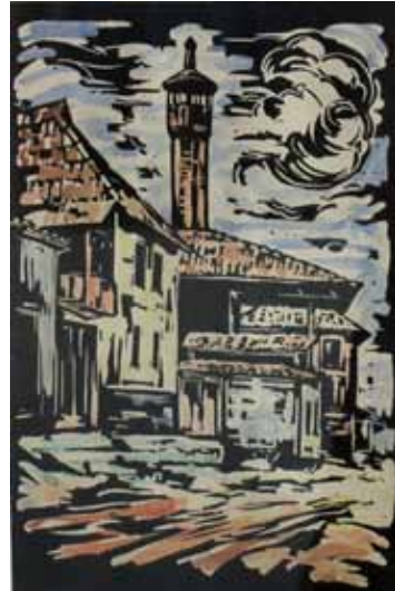
Tables I/2: Daniel Kabiljo, A Street in Sarajevo , colored linocut, 1937(?), private collection, Sarajevo